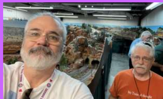
All Points North